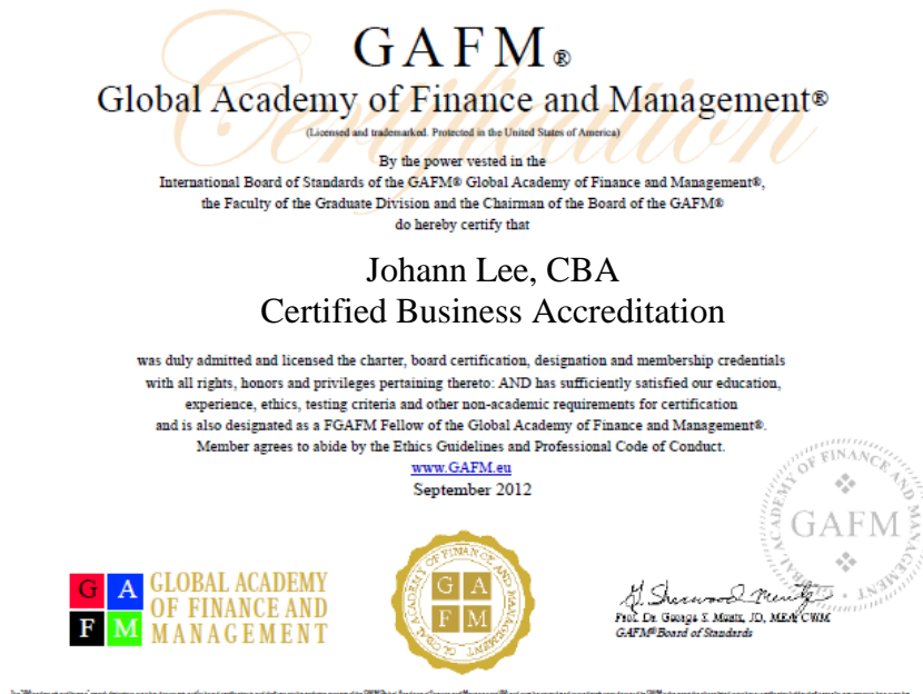
Figure 2 – Sample Certification and Fellowship declaration

The GAFM ® Quality Certification Documents can be displayed in plain view either mounted separately or together. The Certification, Membership & fellowship certification can only be displayed if you are in Good Standing with the Academy and you are recorded on the GAFM member register as a current member.